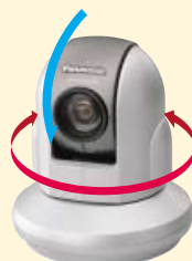
Table Type Pan 350°(Max) Tilt 120°(Max)

Ceiling Type Pan 350°(Max) Tilt 90°(Max)